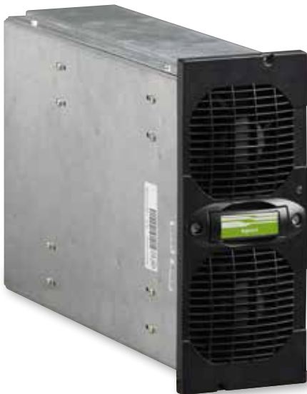
Compact and lightweight single phase power module (only 8.5 kg)