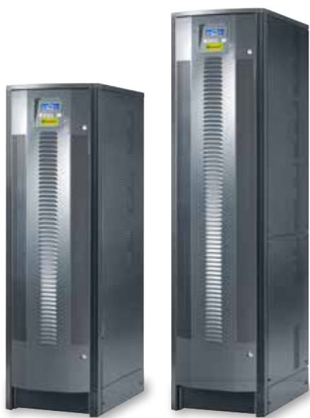
3 109 90