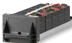
3 108 75