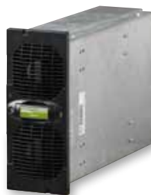
3 108 71