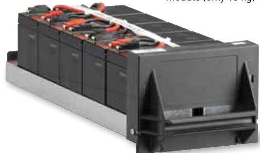
Manageable and easy to install battery module (only 13 kg)