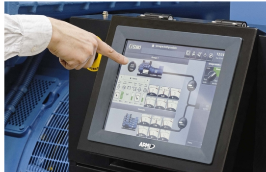
APM802 dedicated to power plant management

The new APM802 command/control system is specifically designed for operating and monitoring power plants for markets including hospitals, data centres, banks, the oil and gas sector, industries, IPP, rental and mining. This unit is available as standard on all generating sets from 275 Kva designed for coupling. It is optional on the rest of our range.