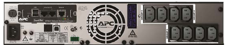
[ SMX1500RM12UNC ]