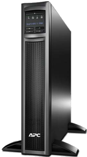
[ SMX1500RM12U ]

Convertible extended run models ideal for critical servers and voice/data switches.