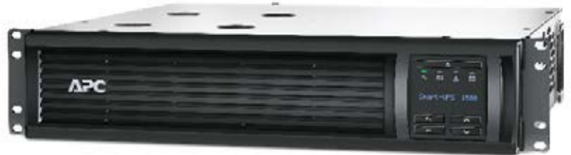
[ SMT1500RM12U ]