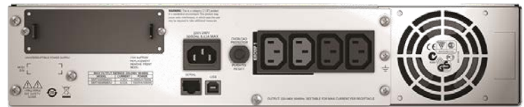
[ SMT1500RM12U ]