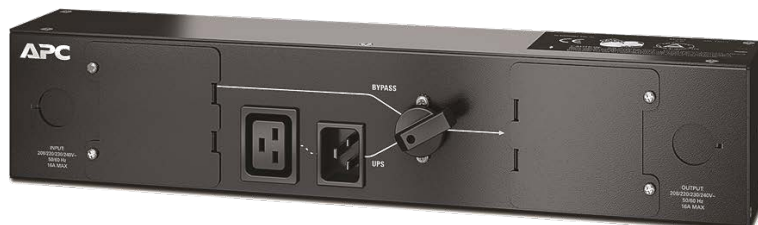
[ SBP3000RM ]

SBP3000RMHW: APC Service Bypass Panel, 100 - 240 V; 30 AMP ; BBM; Hard-wire Input/Output