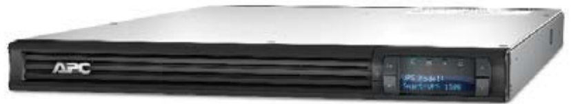
[ SMT1500RM11U ]