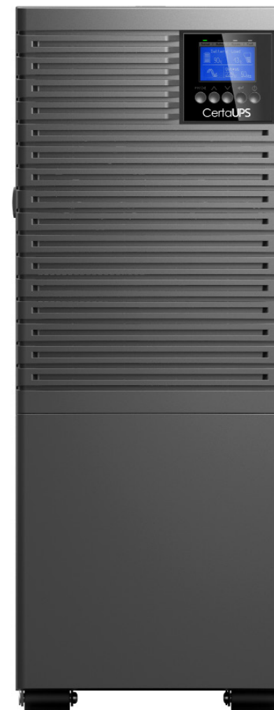
*Image shows 10kVA C550