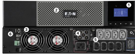
Eaton 5PX 3000i RT2U