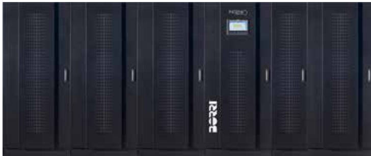
DAY 1 : 1200 kW

INGENIO MAX XT power protection system can be configured with 250 kW or 300 kW MPM power modules. Power expansion or redundancy can be implemented at a later stage by installing additional MPM modules up to 2.1 MW without needing to put the UPS on bypass (*). Thanks to its flexible design and installation you can meet your diverse business needs, either to grow or to revamp your mission-critical applications.