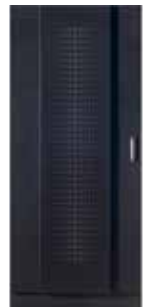
DAY 4 : 2100 kW