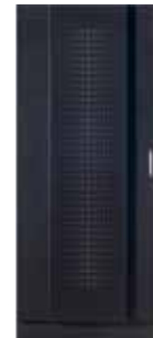
DAY 3 : 1800 kW