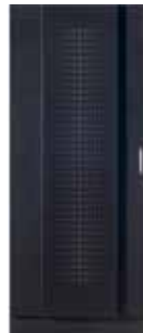
DAY 2 : 1500 kW