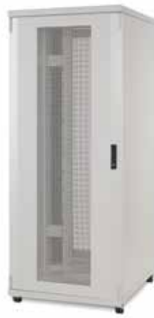
Different widths and depths