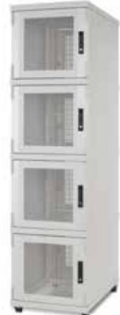
Colocation /split cabinets