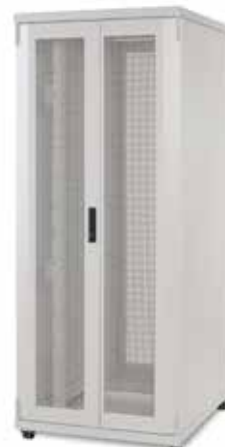
Different door options